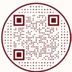
NWS Local Weather Data