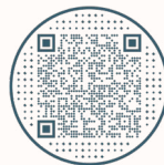
CDC's Death Scene Investigation Toolkit