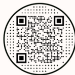
CDC's Heat & Health Tracker