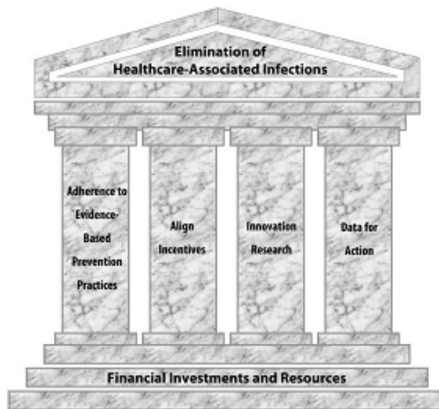
Figure 1. Framework for the elimination of healthcare-associated infections.

Elimination of HAI requires a public health model of constant action and vigilance to promote adherence to evidence-based practices; alignment of incentives and reinvestment in successful strategies; filling knowledge gaps to respond to known and emerging threats through research; and collecting data to target prevention efforts and to measure progress. These efforts must be underpinned by sufficient financial investments and resources (Figure 1). 2