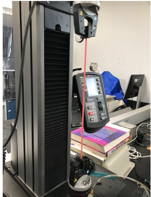
Figure 1. Laboratory Test Photos